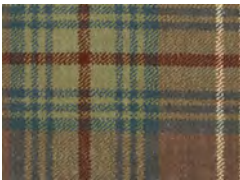
2/2755 Beige Chisholm