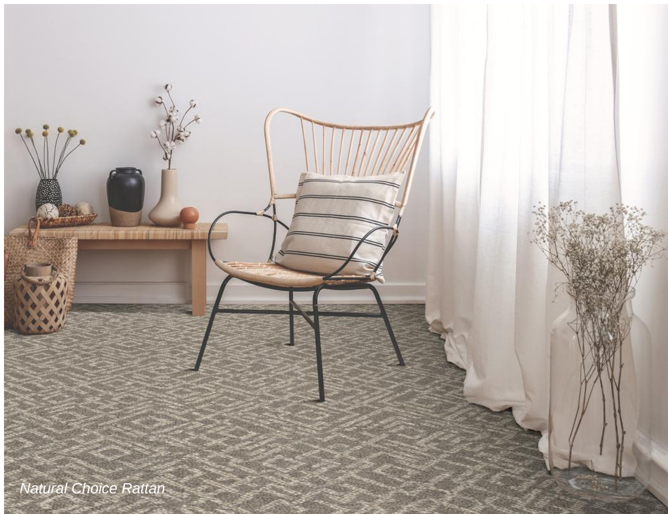
Natural Choice Rattan