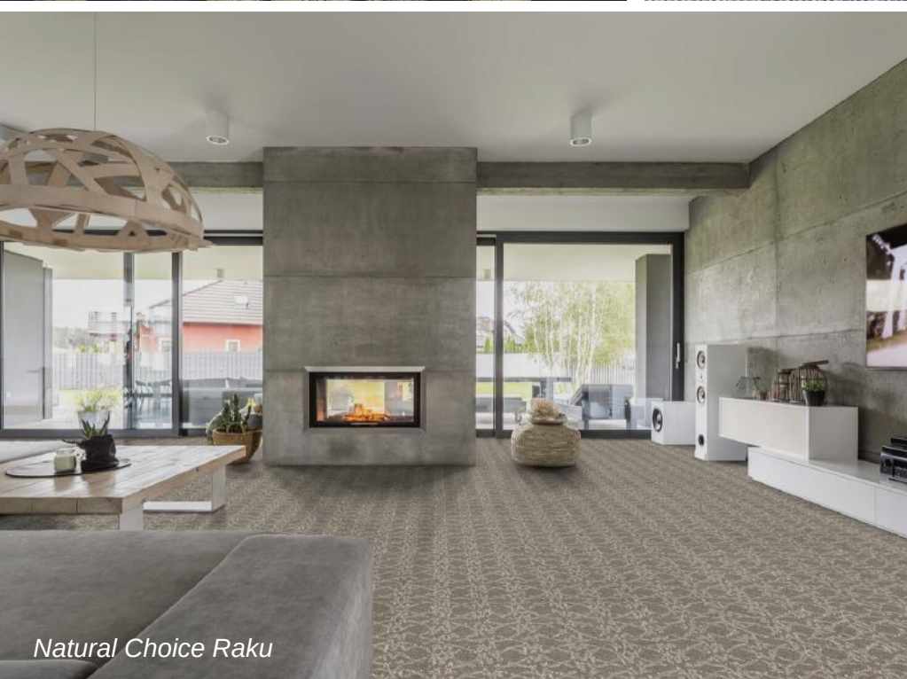
Natural Choice Raku