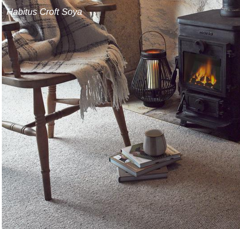
Habitus Croft Soya