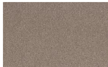
York Wilton Pavilion