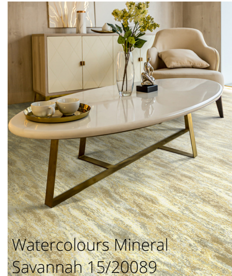
Watercolours Mineral Savannah 15/20089