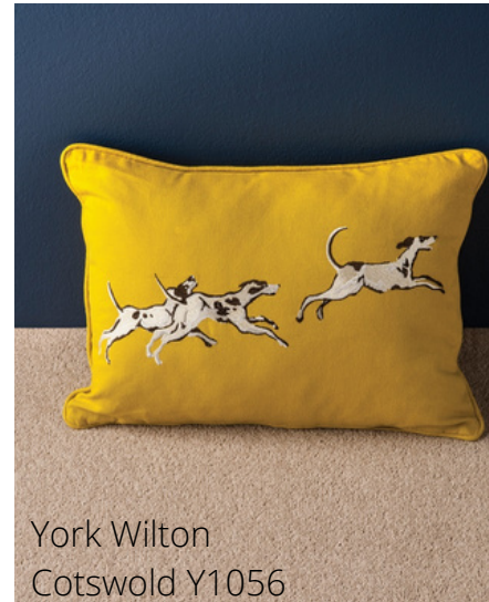
York Wilton Cotswold Y1056