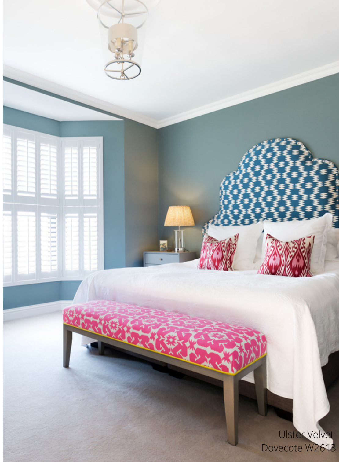
Ulster Velvet Dovecote W2613

Take a look at how you can incorporate these colours into your home using Ulster carpet.