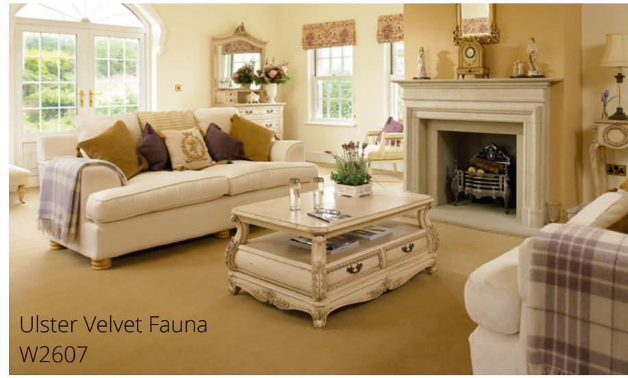
Ulster Velvet Fauna W2607

It has a cheerful brightness that will intensify when used in large areas, but it is always dignified and never garish.