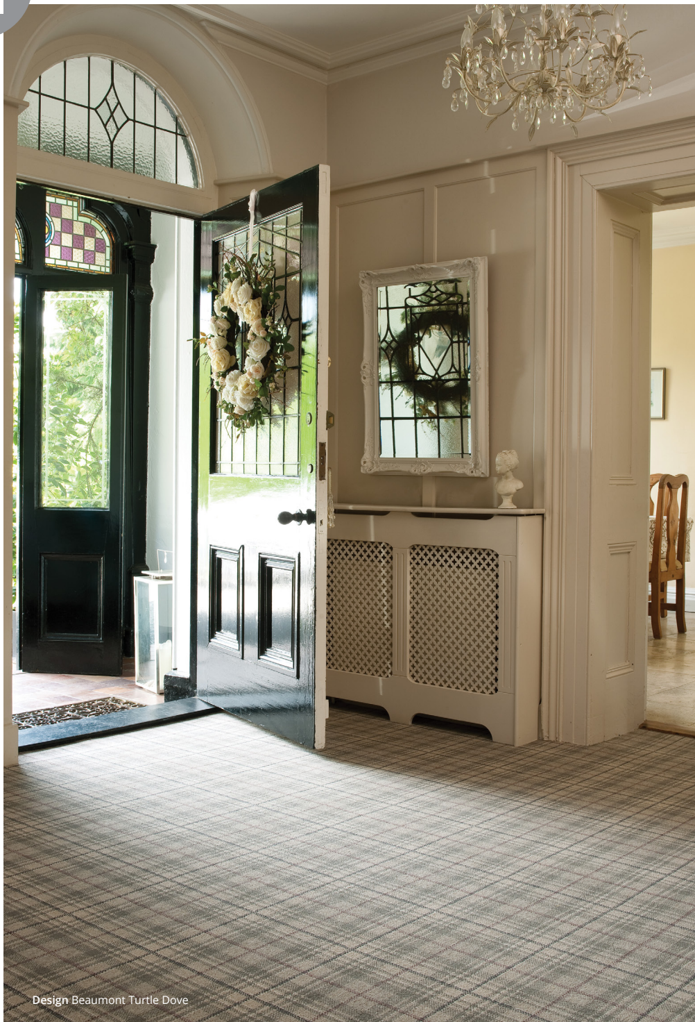
Design Beaumont Turtle Dove