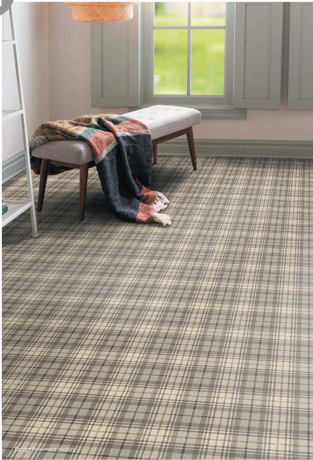
Design Beaumont Hickory