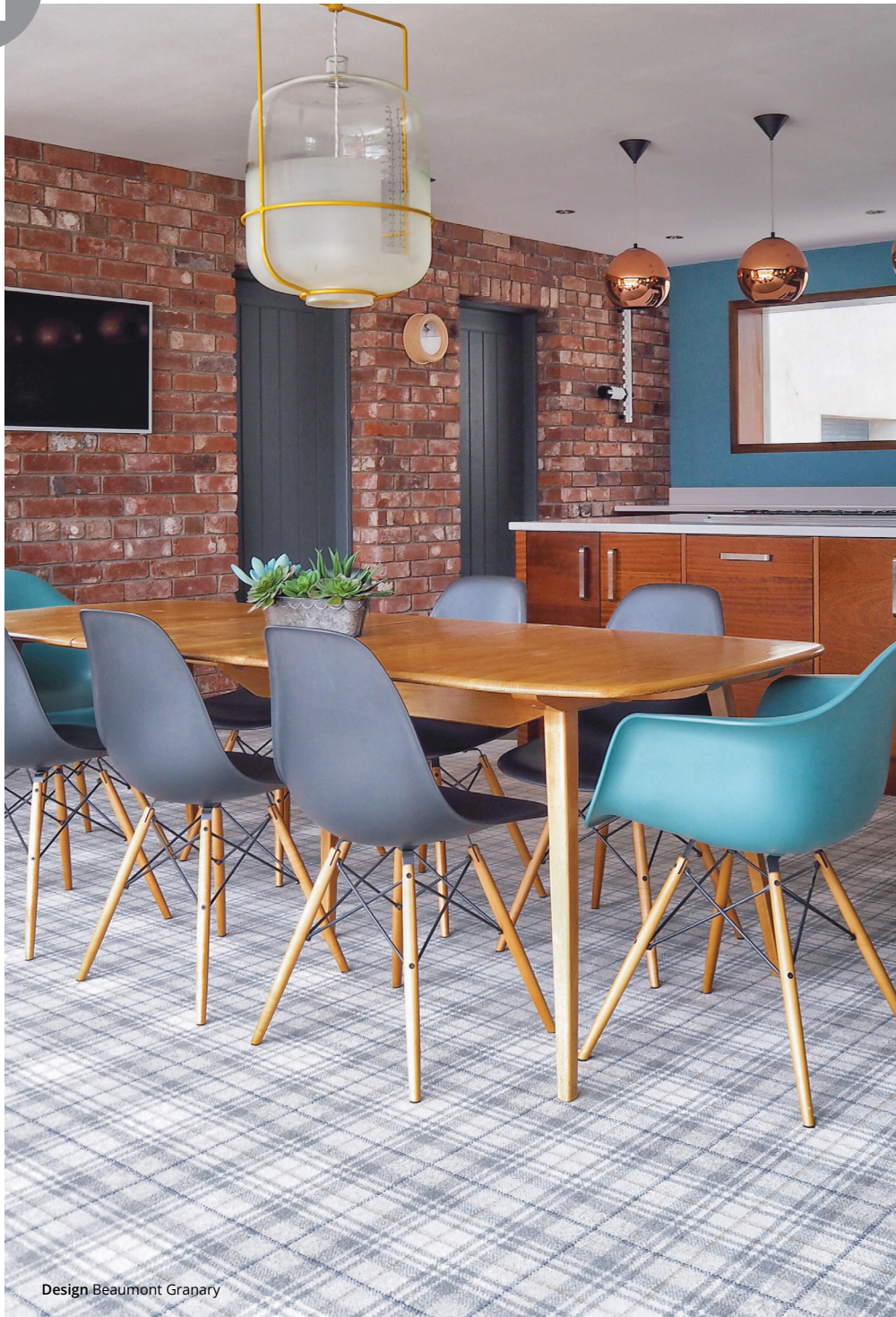
Design Beaumont Granary