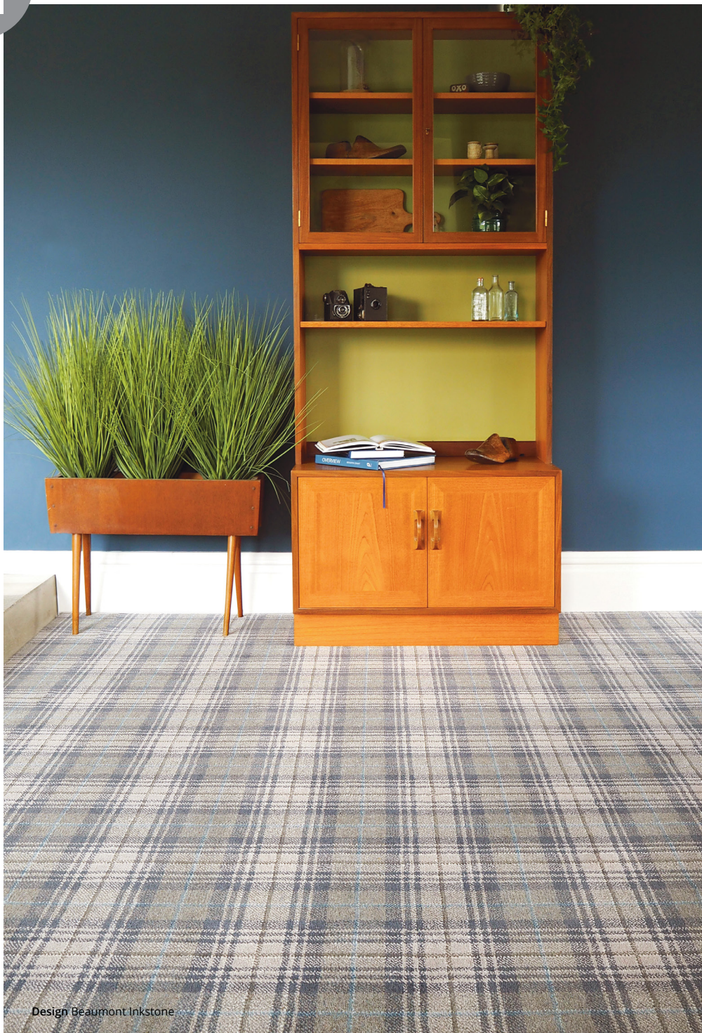
Design Beaumont Inkstone