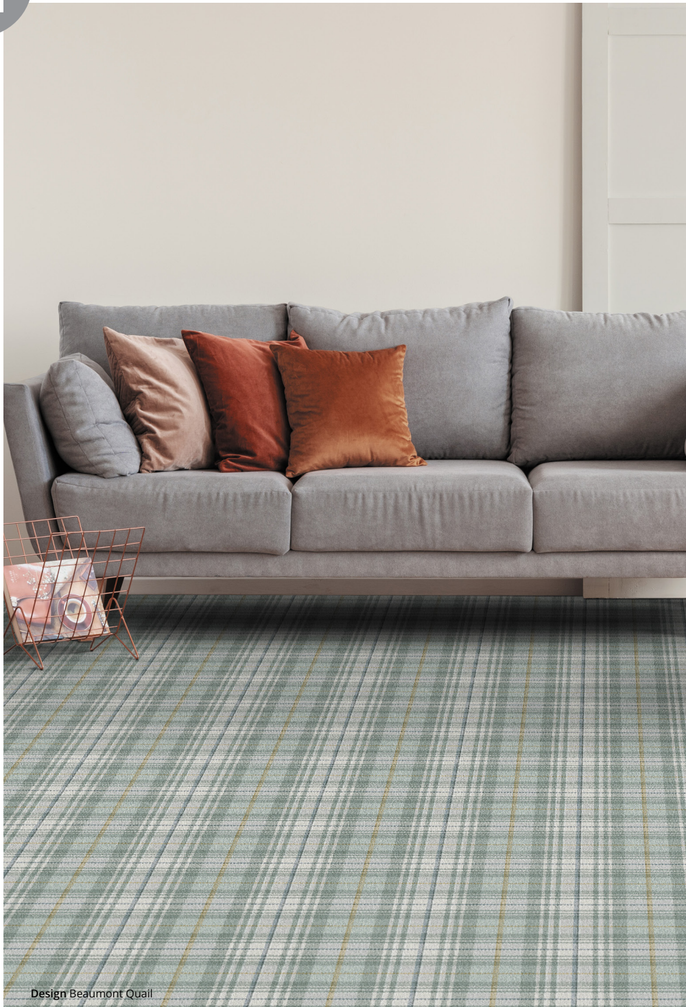
Design Beaumont Quail