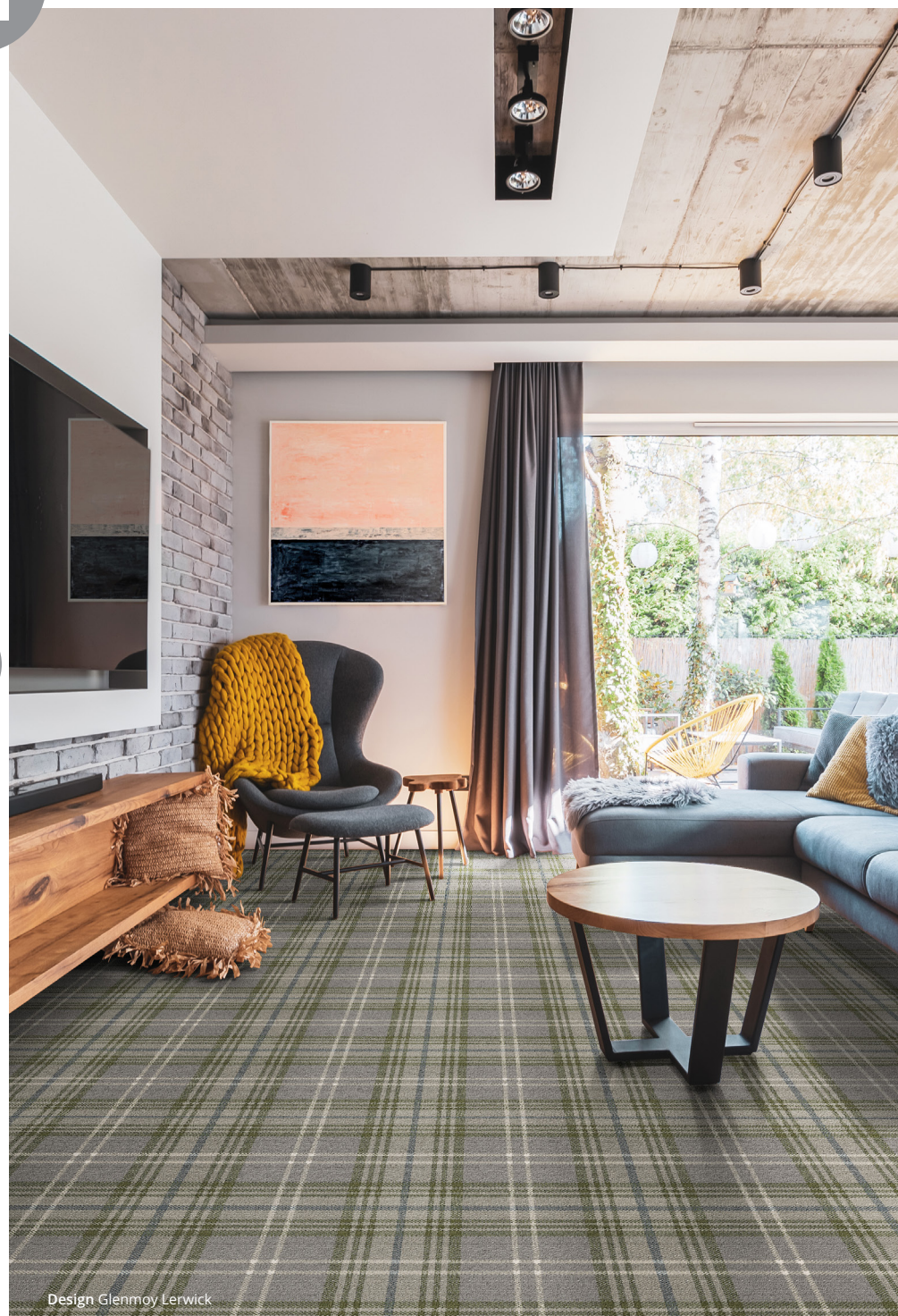
Design Glenmoy Lerwick