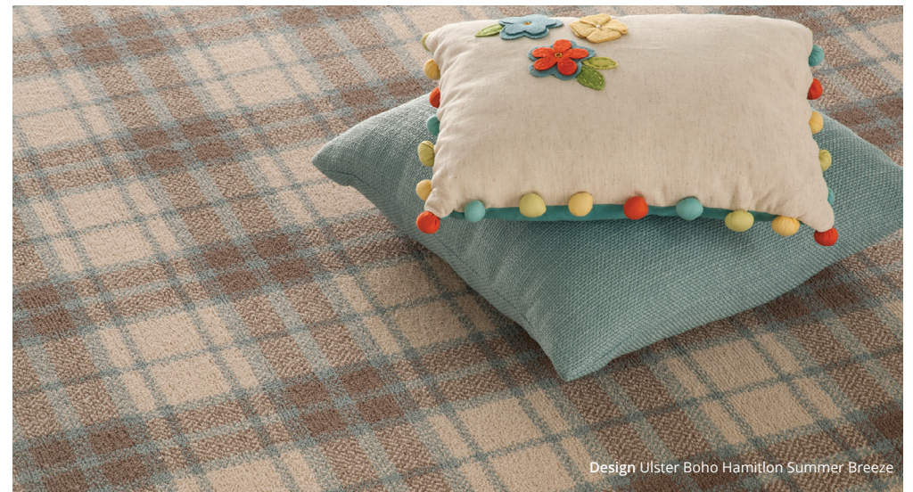
Design Ulster Boho Hamilton Summer Breeze