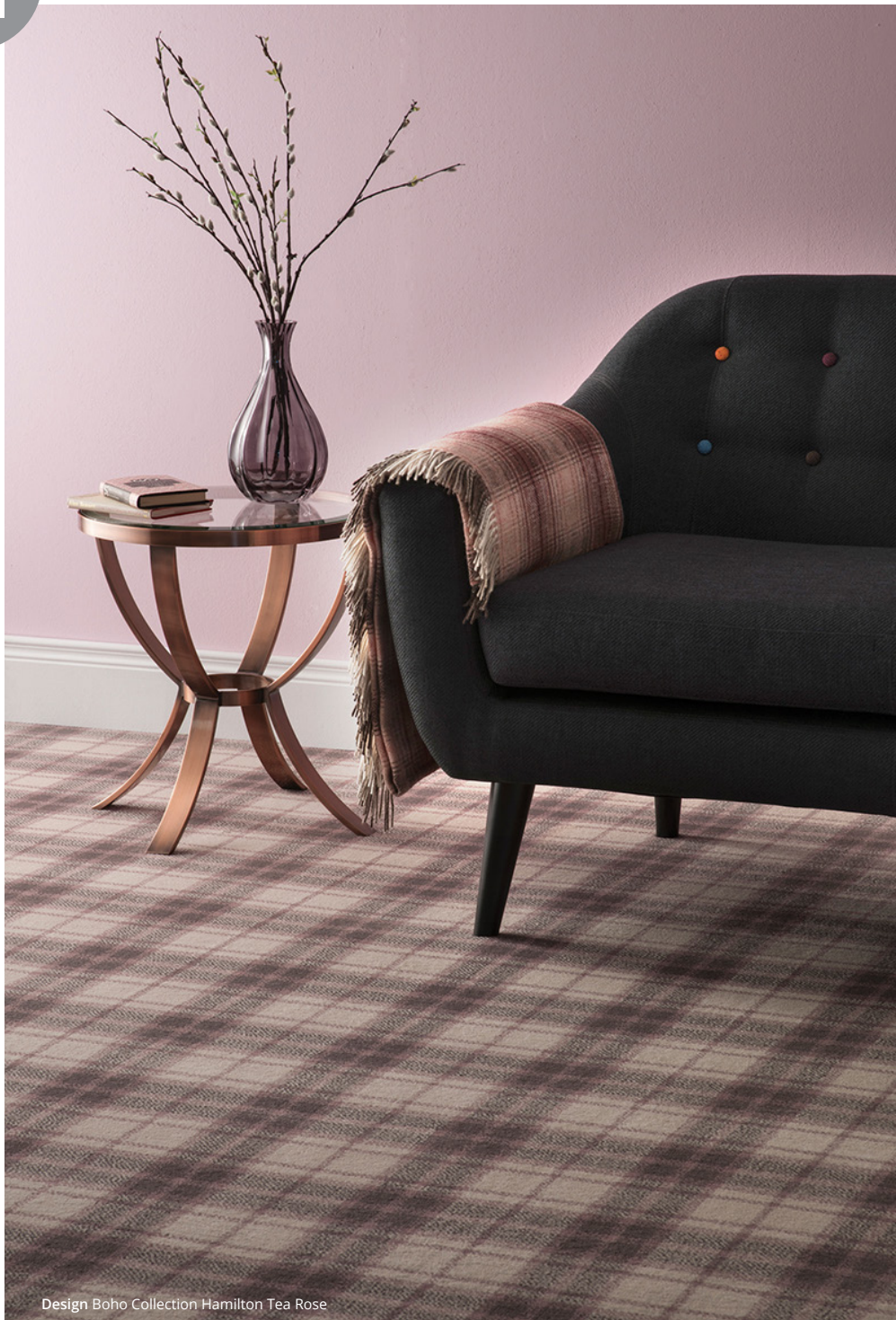
Design Boho Collection Hamilton Tea Rose