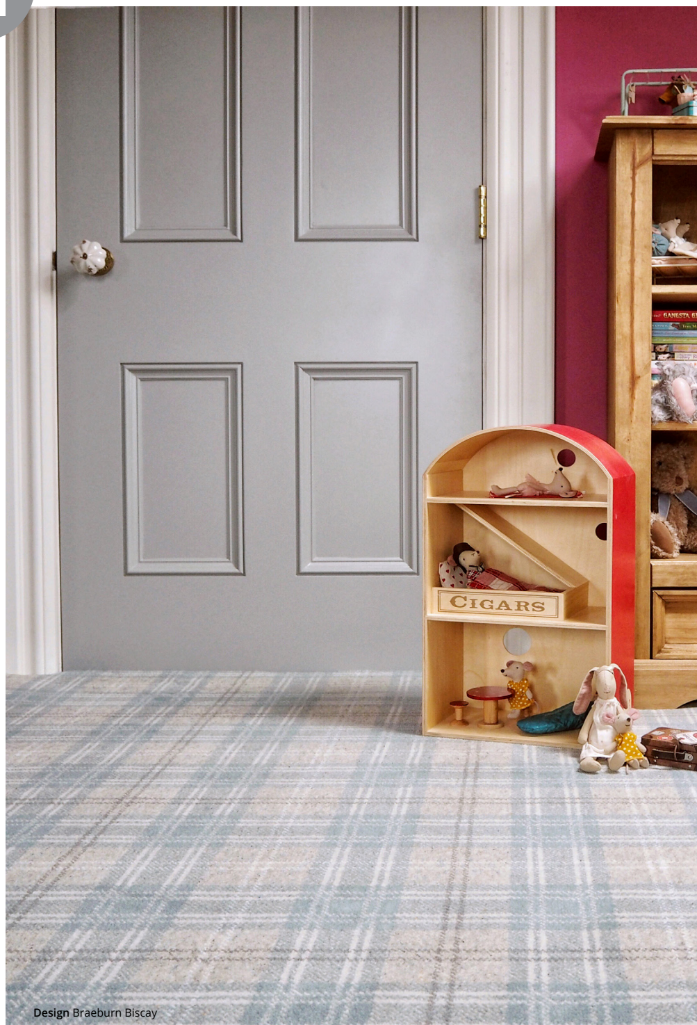
Design Braeburn Biscay