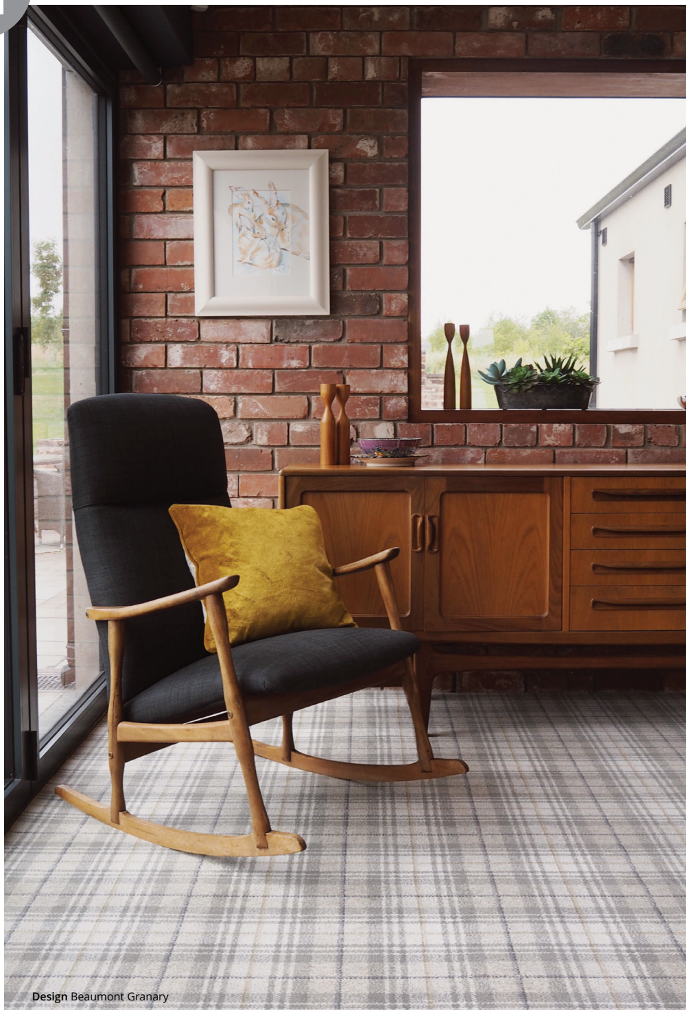
Design Beaumont Granary