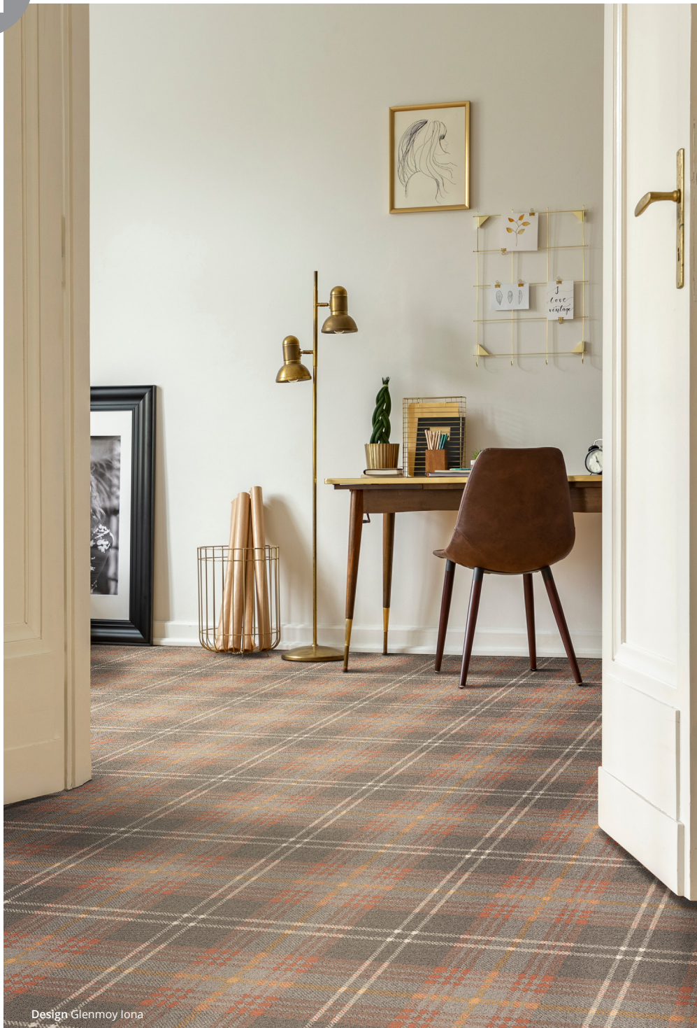
Design Glenmoy Iona