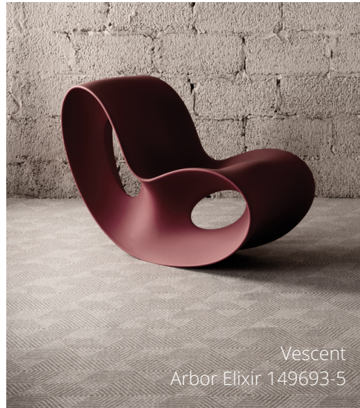
Vescent Arbor Elixir 149693-5