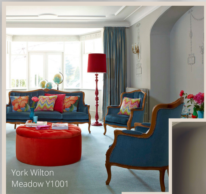
York Wilton Meadow Y1001