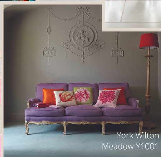
York Wilton Meadow Y1001