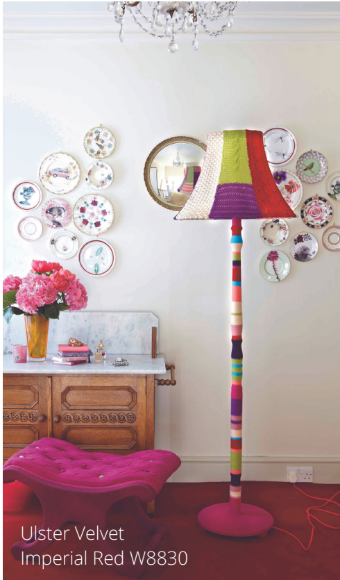
Ulster Velvet Imperial Red W8830