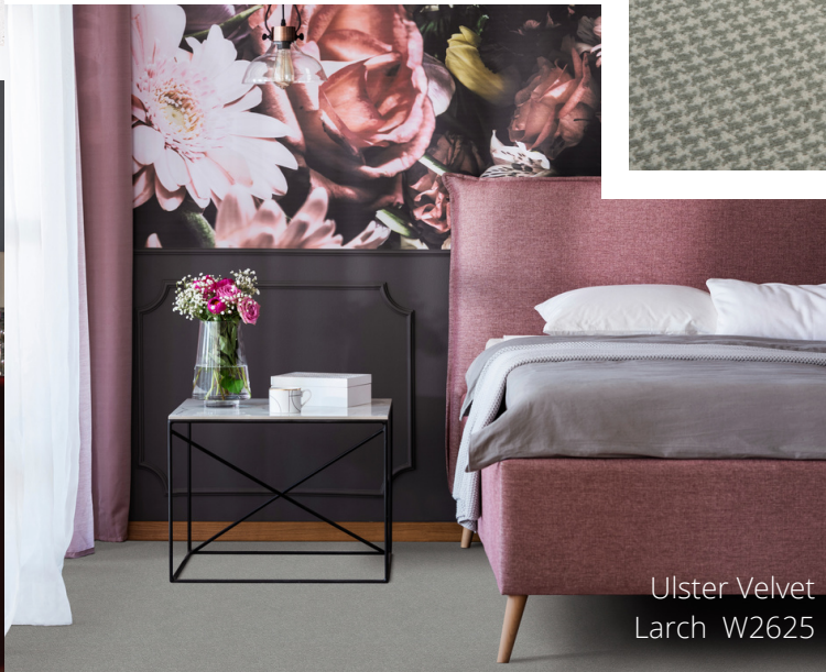
Ulster Velvet Larch W2625