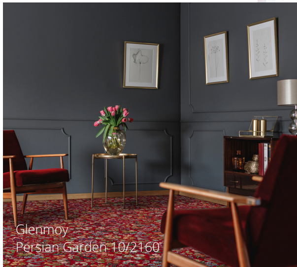
Glenmoy Persian Garden 10/2160