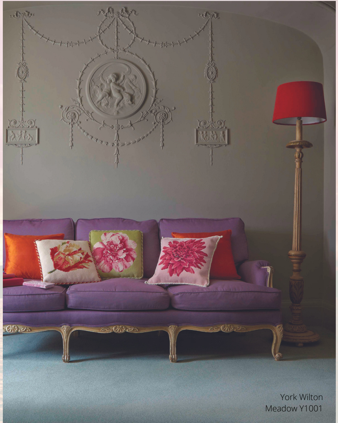
York Wilton Meadow Y1001

Take a look at the following pages for inspiration on how to incorporate this vibrant colour into your home.