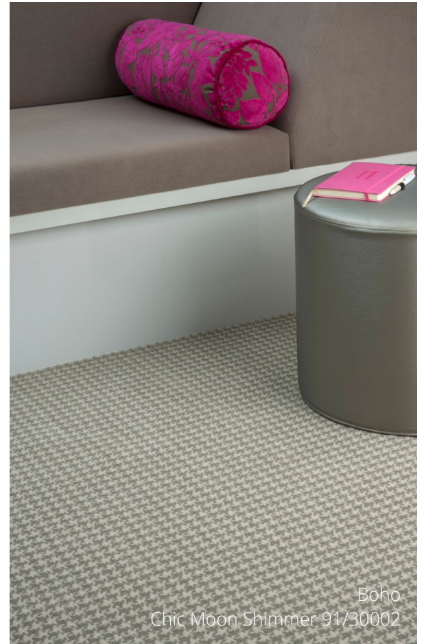
Boho Chic Moon Shimmer 91/30002